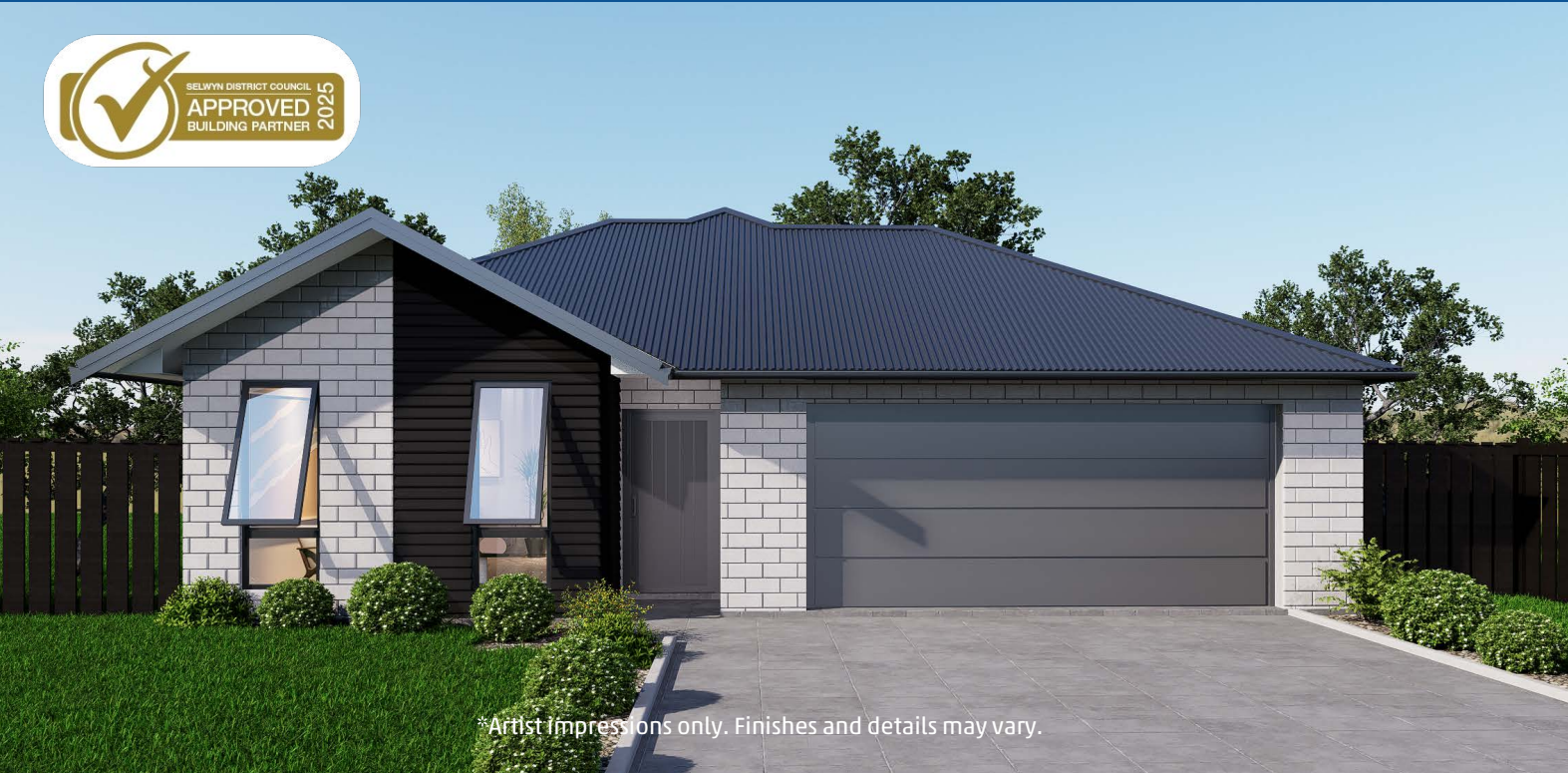
*Artist Impressions only. Finishes and details may vary.